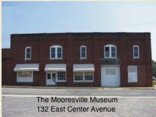
The Mooresville Museum 132 East Center Avenue

Board meetings are held monthly on the second Tuesday. April-December, the Board meets at 7 PM in the Museum. January-March, it meets at the Mooresville Public Library, 7 PM in January and February and 6 PM in March. The Annual Membership Meeting is held on the second Tuesday in March at 7 PM in the Mooresville Public Library. All meetings are open to the public.